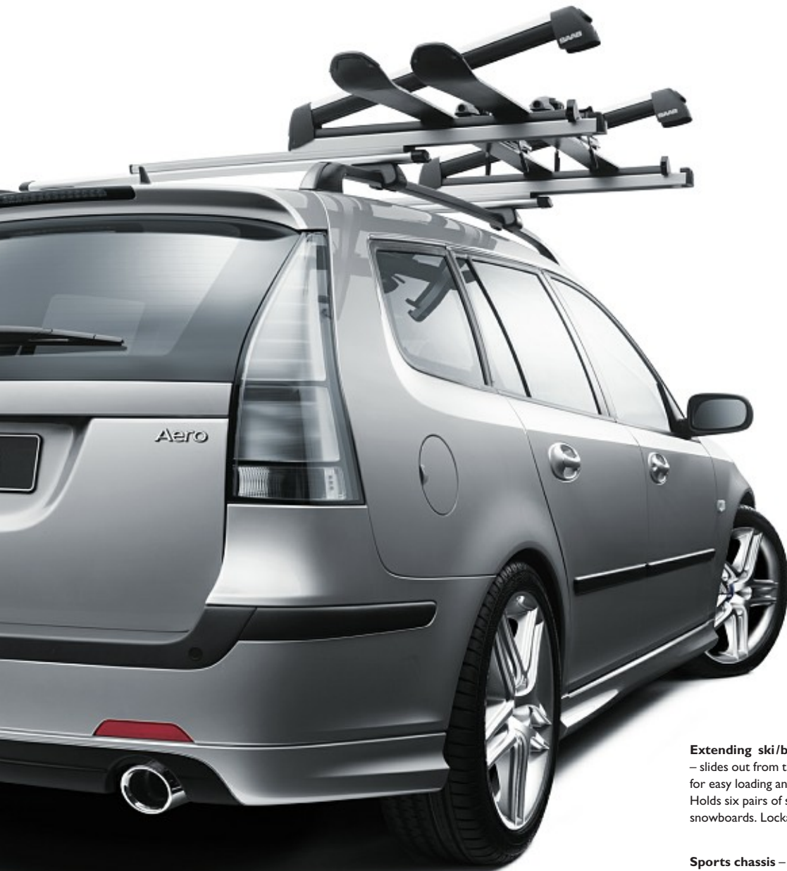
5-spoke Claw – 18 × 7 1/2" light alloy wheels