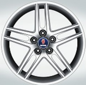
5-spoke Double Bridge – 17 × 7 1/2" light alloy wheels