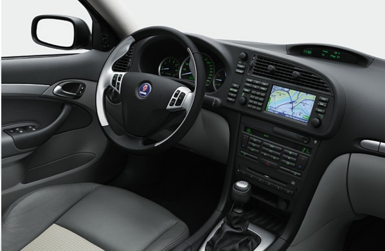
Door trim, metallic-effect – for the front and rear doors.

Aero steering wheel – sports steering wheel with accentuated thumb grips and thick ergonomic grip, trimmed in leather. Includes metallic-effect inserts.