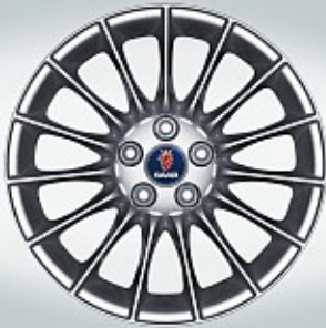
15-spoke – 17 × 7" light alloy wheels